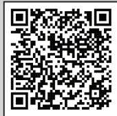
South of Withlacoochee Trail Bridge to north of N. Sportsman Point

Point your phone camera at the code and click the link when it appears or visit the links below.