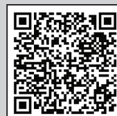
North of N. Sportsman Point to north of East Arlington Street

fdottampabay.com/project/473/257165-4-52-01 fdottampabay.com/project/474/257165-5-52-01